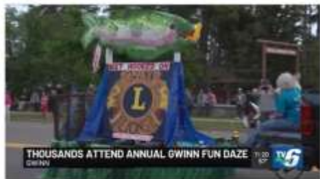
The Gwinn Lions Club put the fun in its annual Gwinn Fun Daze event on Saturday.